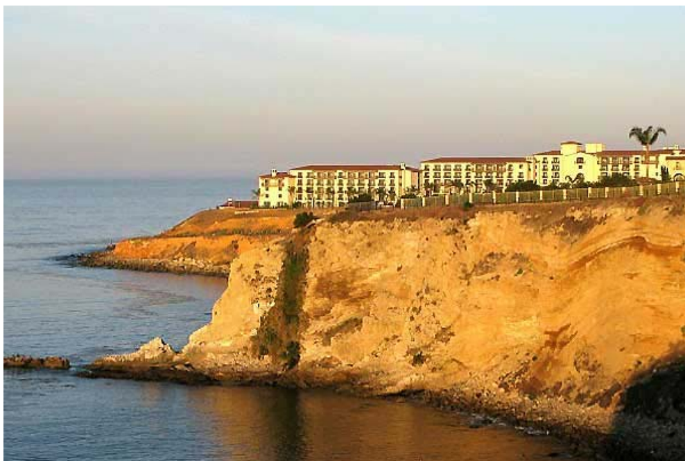
Terranea Resort is located in Palos Verdes, south of LA

Progressive hotel group + teambuilding company join forces to change the world